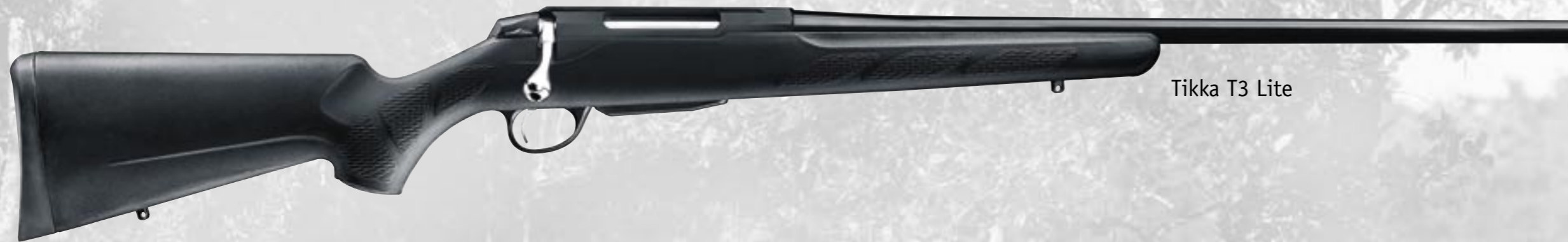
Tikka T3 Lite