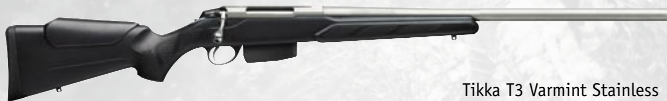
Tikka T3 Varmint Stainless

with optional Picatinny rail, scope mounts, scope and extra large bolt handle.