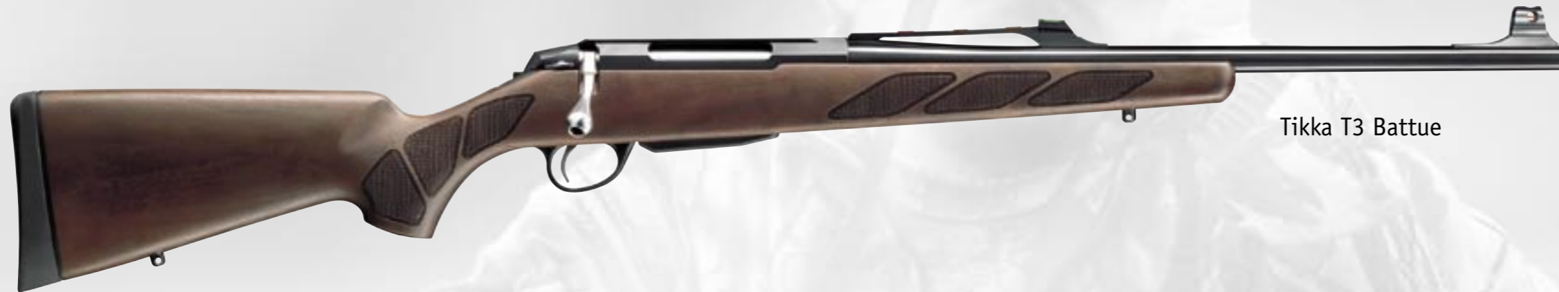
Tikka T3 Battue