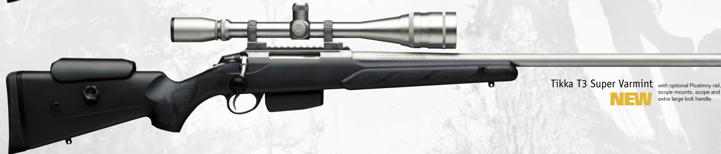
Tikka T3 Super Varmint