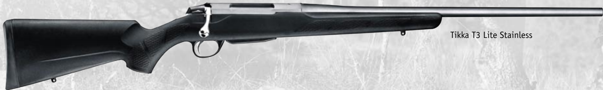
Tikka T3 Lite Stainless

The Tikka T3 Lite has all black stock with blued cold-hammer forged free-floating barrel. The light but sturdy T3 TrueBody glass fiber reinforced polymer stock is pure Sako innovation. The straight stock combines high performance and light weight. Positive checkering for comfort and firm grip in all conditions. Improve your marksmanship with this stealthy T3 challenger.