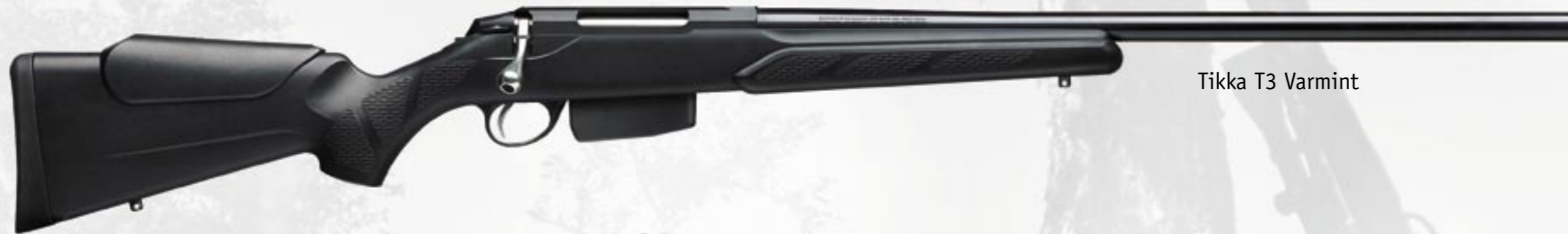
Tikka T3 Varmint