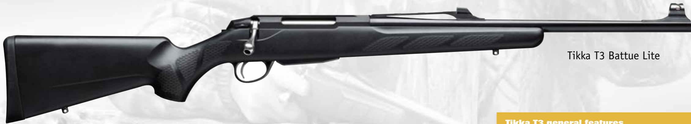
Tikka T3 Battue Lite

These lightning-fast rifles are built for driven hunts where most shots are taken at running game over relatively short distances. These remarkably handy rifles are also the top choice for a hunter who trek and hunt in heavy cover.