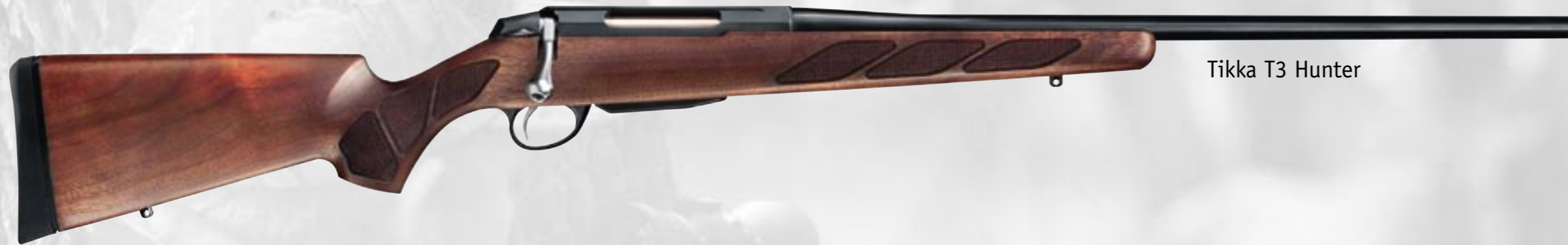
Tikka T3 Hunter