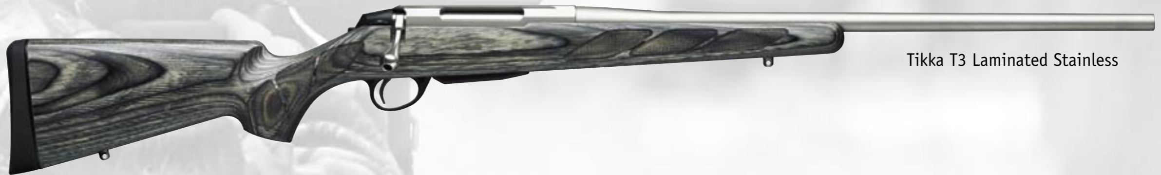
Tikka T3 Laminated Stainless

The Tikka T3 Hunter is for the hunter looking for top performance and innovation, but who prefers a classic style and feel. The high-grain walnut stock is selected and shaped by Sako master gunsmiths. The T3 Hunter offers an extensive caliber selection for hunting and sport shooting. An "old-world" platform based on modern thinking, taking you to a new level in accuracy, reliability ...and shooting enjoyment.