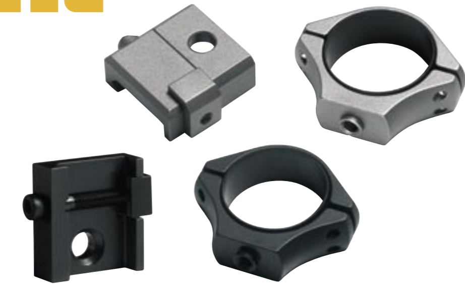
New Optilock Weaver base makes the use of Optilock rings possible in all rifles with Weaver or Picatinny rails.